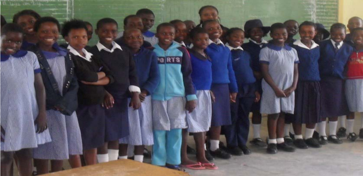
The GEM Club at Chinamano Primary School Epworth.